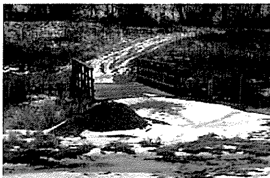
A new equestrian bridge on the Yellowstone Wildlife Area

The trail, 30 miles, is used by approximately 1000 users annually. The kind of use necessitates the use of bridges to eliminate aquatic habitat destruction.